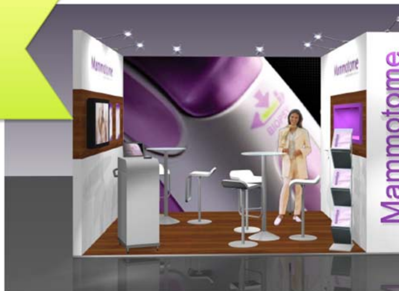
Exhibit Hours: Thursday 2:00pm to 6:00pm, Friday through Monday and 10:00am to 6:00pm