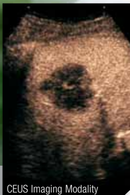
CEUS Imaging Modality