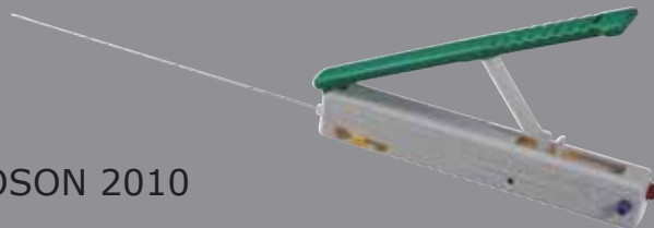
BioPince Full-Core Biopsy